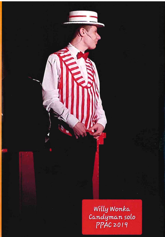
Willy Wonka Candyman solo PPAC 2019